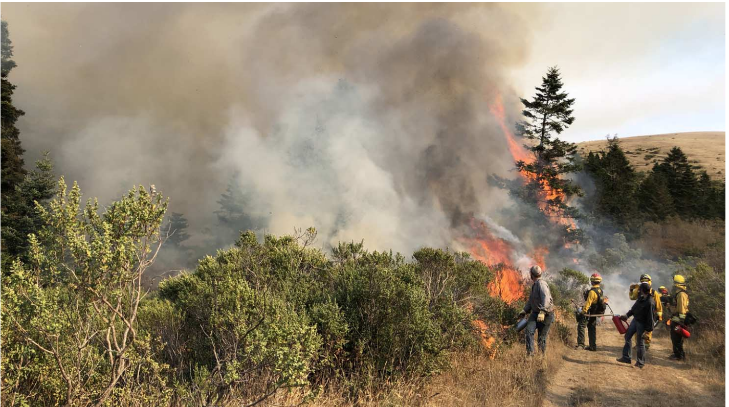
Prescribed Burn Association burning in encroached coastal prairie, Humboldt County, CA.