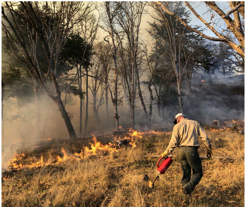
Right: Do-it-yourself winter burning in oak woodlands, Humboldt County, CA.