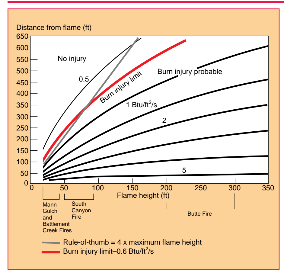
Figure 1 —Lines represent predicted radiant energy arriving at the firefighter as a function of flame height and distance from the flame. It is assumed that the firefighter is wearing fire-retardant clothing and protective head and neck equipment. The heavy shaded line represents the burn injury threshold of 0.6 Btu/ft²/s (7 kW/m²). The heavy solid black line indicates the rule of thumb for the size of the safety zone.

Mann Gulch Fire, the Battlement Creek Fire, the Butte Fire, and the South Canyon Fire.